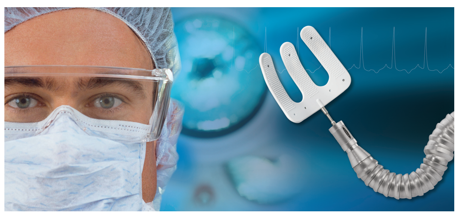
Simple. Smart. Solutions.

Assistant<sup>™</sup> Attachment with StableSoft<sup>™</sup> Technology Hercules 3<sup>™</sup> Stabilizing Arm